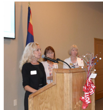
Call to order, prayer, pledge