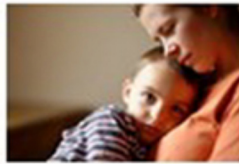
Referrals to Crisis Counseling