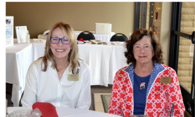
Members & Guests