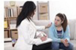
Forensic Exams & Interviews