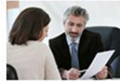
Referrals to Legal Services