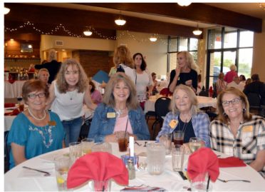
Members & Guests