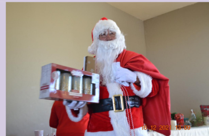
Thank you Santa!!