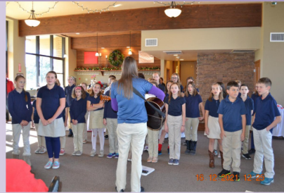
Thanks to the Trinity Christian School Choir