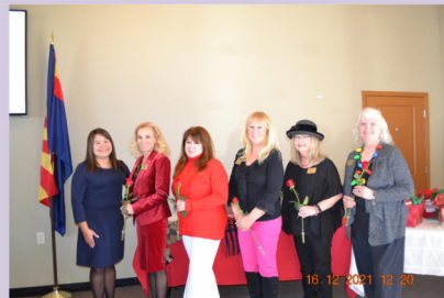
Installation of 2022 GMRW Elected Officers