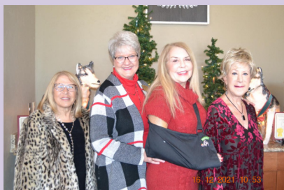
Thanks to our members