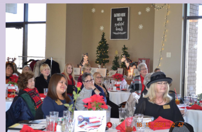
Thanks to our members