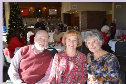
Thanks to our members