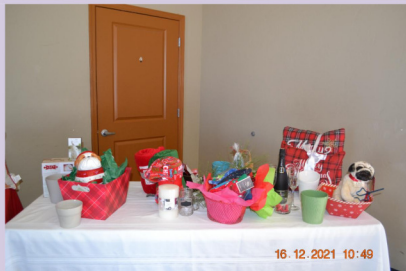
Congrats to the lucky winners of the raffle items!